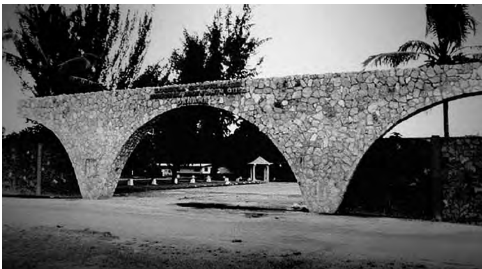
The gate to Herrera-Ruiz Military Institute at Rio Hato

Once a sufficient number of troops from the two ranger battalions had gathered at their assigned assembly areas, the units were finally able to begin moving to their primary objectives. For elements of Company A, 2d Battalion, that meant clearing and securing the Herrera-Ruiz Military Institute, the noncommissioned officer training school in the vicinity of both the PDF 6th Company and 7th Company compounds. The assault began with a fire team