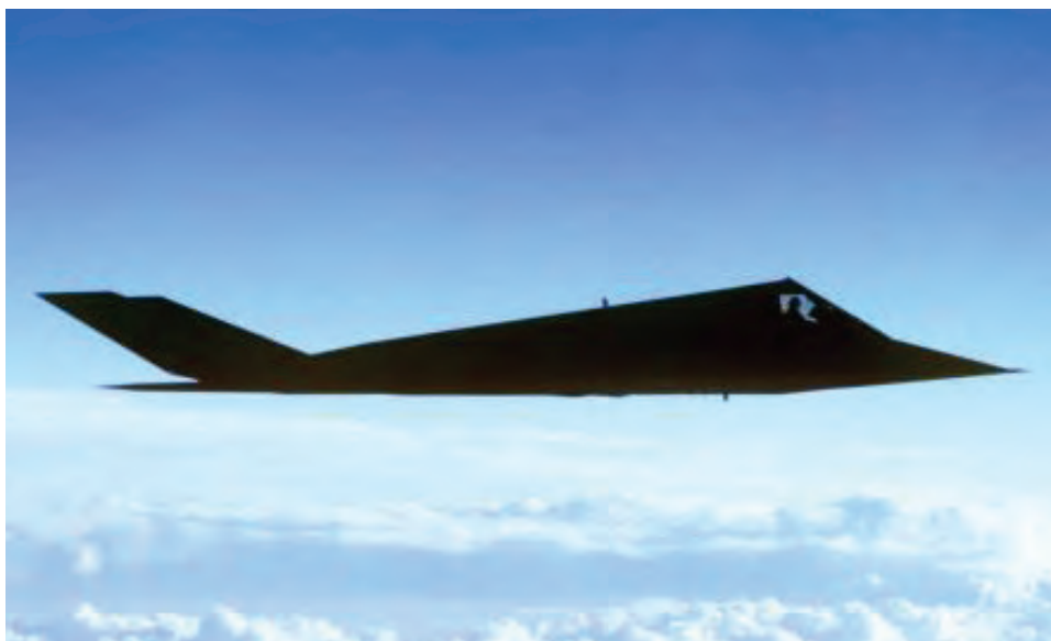
F-117A Stealth fighter (photo taken one year after Operation JUST CAUSE)

Discussion surrounding the decisions had been lengthy and at times heated. Once Rio Hato became a primary target, U.S. planners devised a plan of attack that, from the outset, sought to minimize the threat to exposed Rangers dropping onto the airfield. What concerned General Stiner as much as the ZPU4 air defense systems was the “small arms fire in mass” the two PDF companies could train on the Rangers as they descended onto the objective. One means to prevent the Panamanian forces from mounting a deadly defense was to subject them to a massive aerial barrage just prior to the ranger assault. In the SOUTHCOM and JTF-South versions of the operation plan approved by the Joint Chiefs in early November, the preassault fires were assigned to