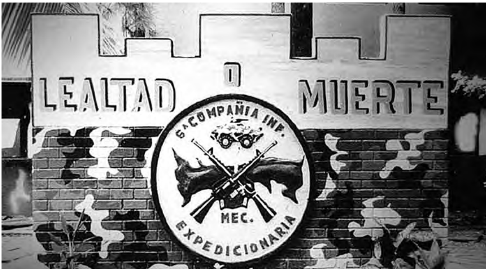
Outside the PDF 6th Infantry Company headquarters, a sign in Spanish reads “Loyalty or Death.”