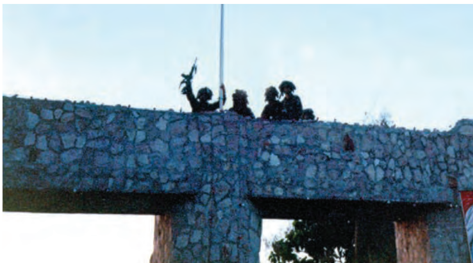
Rangers at the entryway to Rio Hato airfield after capturing a .50-caliber machine gun

Both Ramos and Newberry later received the Bronze Star for removing this major impediment to the ranger plan of attack. 37