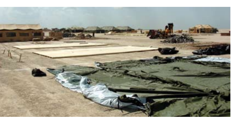
Build-up of Camp Loki. At its peak, the camp supported over 5,000 special operations forces.

Recalcitrance hurt the insertion of TF Viking in its effort to support the Kurds, but it also eliminated staging the U.S. 4th Infantry Division from Turkey. In an effort to get the maximum number of combat soldiers on the ground in the early days of the campaign, the 173rd Airborne Brigade (-) was to parachute into Bashur Airfield. The drop occurred on 25 March, and sustaining the 173rd became a major requirement for TF Support. With eightynine sorties of C-17s diverted during the 96 hours of the of the 173rd's insertion, TF Viking was forced to reconfigure its loads for transport on the few MC-130s of the