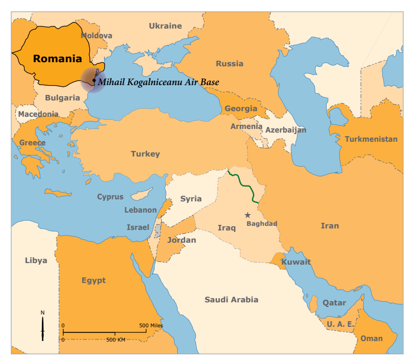
Constanta Romania became the location of choice for the staging of TF Viking when Turkey was unavailable.