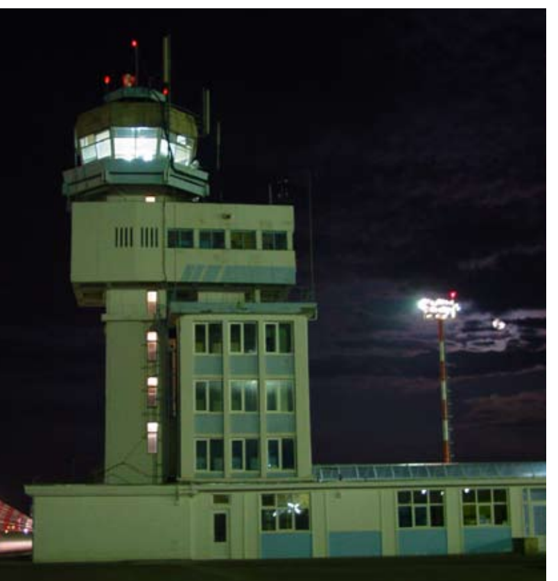
Mikhail Kogalniceanu Airfield, Romania, location of the intermediate staging base for TF Viking.

Turkey balked at the transit of Coalition forces on 1 March 2003, the CJSOTF scrambled madly to find an alternate location for staging. Their solution was in Europe, where the 10th SFG routinely operates.