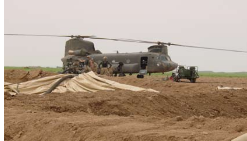
The TF Support operations refueled aircraft as required. Refueling a CH-47 helicopter of the 101st Airborne Division.

TF Support was constantly juggling priorities to provide the right logistical support to sustain an everincreasing population at Camp Loki and the proper mix of supplies for fifty-one ODAs operating along the Green Line. "This was not a well-developed area. We were constantly in communication with our elements in Germany and Romania telling them what was needed. Loads changed constantly, sometimes with the aircraft propellers turning," LTC Hurst commented on the buildup of forces at Camp Loki. "We went from 1,500 to 5,000 personnel in one week."<sup>18</sup> The resourcefulness of the task force was again stretched tight when the city of Mosul