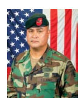
Colonel Edward M. Reeder

ment of the Group in Colombia. "The following represents the 7th SFG(A) benefits from the myriad operations in Colombia: increased foreign internal defense skill sets, better understanding of counternarcoterrorist operations, executing complex and dynamic command and control, increased language skills with complete immersion with the partnered nation, and interacting with the U.S. Country Team and the most senior ranking officials from the Government of Colombia, are just some of the benefits of our ongoing efforts in Colombia."<sup>13</sup>