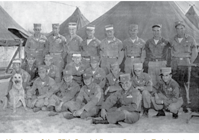
Members of the 77th Special Forces Group in Training at Onslow Beach, North Carolina, 1953.

ion) of the 7th SFG deploy throughout the SOUTHCOM AOR in support of a wide variety of missions. And in the post-9/11 era of the Global War on Terrorism, the 7th SFG has joined other Army Special Forces groups in regular rotations to the U.S. Central Command theater. These rotations have significantly affected the size and scope of the unit deployments to the SOUTHCOM area.