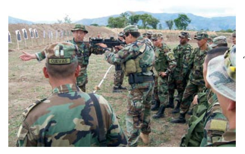
The 7th Special Forces Group has a long history of training with the Colombian Army. Special Forces troops conducting marksmanship training on the range at Tolemaida.