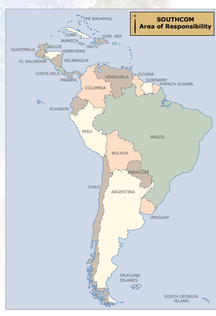
SOUTHCOM Area of Responsibility

eates the strategic mission goals. Only Colombia is singled out among the other nations in the AOR as important enough to warrant a specific goal: Support the Colombian government's efforts to defeat terrorists, reduce drug trade, and gain control of Colombian territory, while adhering to the international human rights norms and the rule of law."6 In Colombia, SOUTHCOM is represented by the Military Group (MILGP), located at the U.S. Embassy in Bogotá.