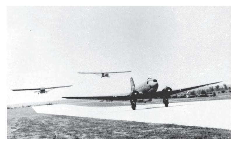
In the glider jump tests, a C-47 aircraft would tow two paratrooper-laden CG-4A Waco gliders.

ers. . . . I spun around—not smart enough to open my reserve. I spun until I was almost horizontal, but I was lucky on the landing. . . . As difficult as our training was, I still appreciated it. I was almost glad to get into combat though; it was easier than the training."<sup>13</sup>