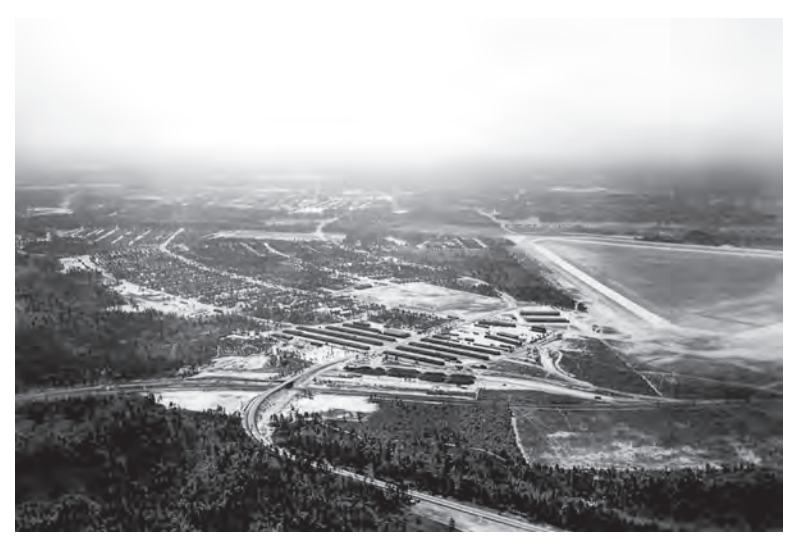
Camp Mackall in 1945.

In reality, the glider jump tests were anything but successful. Gliders had not been designed for jumping