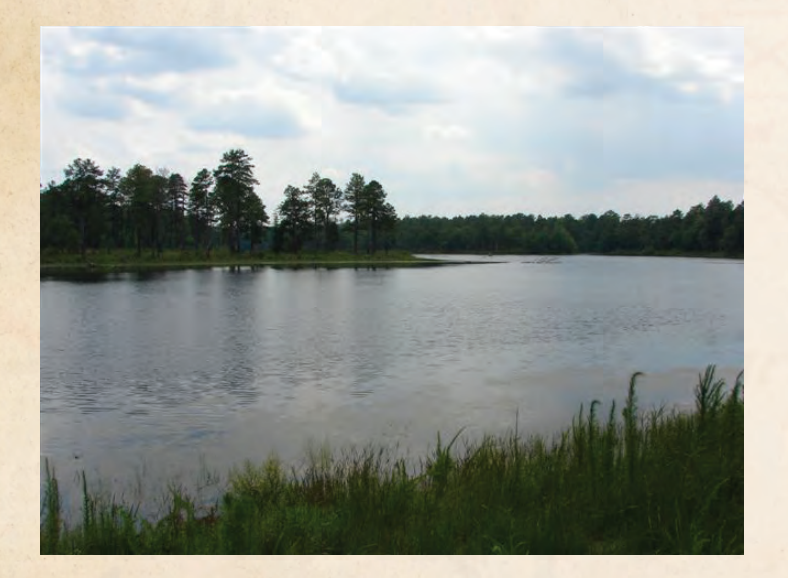
Lake Kinney Cameron near where the eight 551st PIB paratroopers drowned on 16 February 1944.

TESTING and validating airborne techniques was not without risk. On 16 February 1944, the GOYAs made an illfated night jump. In contrast to Panama, the C-47s were flying in tight "V" formations, making the battalion-sized jump on the narrow landing zone of 1,600 by 2,000 feet even more complicated. Their first night airborne operation was conducted in fog and rain and they were flown by inexperienced troop-carrier pilots. The drop zone selected was a small clearing bounded by small lakes.<sup>1</sup> Many of the paratroopers were dropped into Lake Kinney Cameron. Several, unable to free themselves from their parachutes and equipment, drowned. 551st veteran Richard Field, then a private first class, recalls, "I landed about ten or fifteen feet from the lake. When I exited the plane, I could vaguely see an area that I thought could be the drop zone. But, when the noise of the planes faded, I could hear screams and splashing. I then realized that it was water so I slipped my chute as much as I could. . . . It was very dark and misty (almost rain.) As soon as I got my equipment and