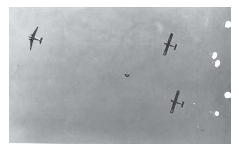
Seen from the ground are 551st paratroopers exiting the towed gliders.

doors with all the static lines bunched at the end of the cable." ^{\!\!\!^{18}}