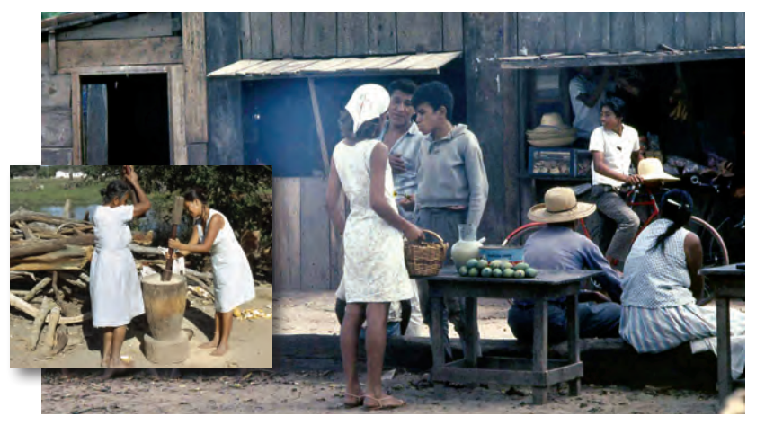
The village of La Esperanza had no electricity, running water, or indoor plumbing. Many aspects of village life, such as grinding corn (insert), had changed little for generations.

hallmark of Army Special Forces is the ability to organize and conduct the training of indigenous military forces in less than ideal situations. When the main body of the 8th Special Forces Group Mobile Training Team (MTT) BL 404-67X arrived in La Esperanza, Bolivia on 29 April 1967 to begin a 179-day deployment, the men were struck by the primitive conditions of the tiny village. "It was pretty spartan," Sergeant First Class (SFC) Harold T. Carpenter recalled.<sup>1</sup> With a population of less than two hundred persons, La Esperanza had no electricity, running water, or indoor plumbing. Selected by the team leader Major (MAJ) Ralph W. "Pappy" Shelton for its access to suitable training areas, the town's remote location provided the operational security necessary to train the new Bolivian Ranger Battalion.