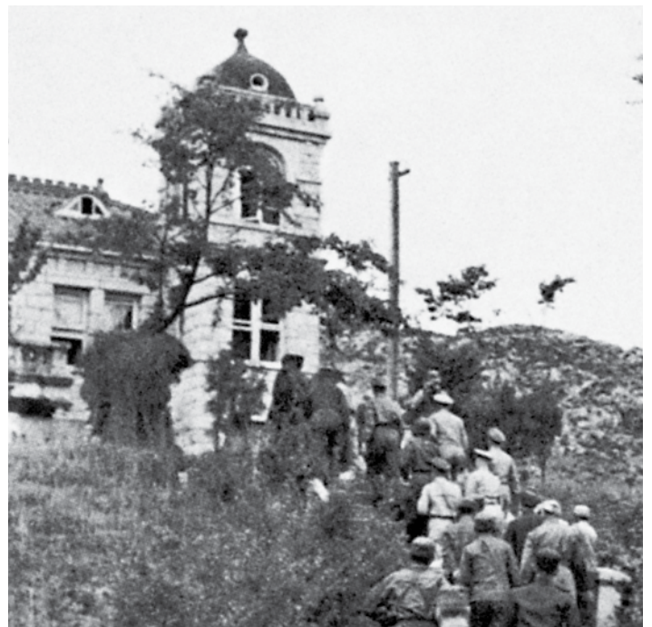
Daily, the UN Liaison Group (all military) was escorted to the Kaesong conference site by North Korean soldiers.

On opening day the Western news media representatives had been denied access to the site by the North Koreans. They watched as the Party press representatives and two sympathetic Western journalists tramped into the negotiation site. Therefore, only one perspective was being presented to the world. By the time LT Brown arrived, the UNC had lodged formal objections to the overlooked caveat and were scrambling to accommodate the Western journalists at a tent city near Munsan-ni. Despite improved billeting, ready access to radio teletype communications, transportation, and on-site military censors, the absence of hard information as “staffers” haggled over Armistice agenda topics upset the reporters.