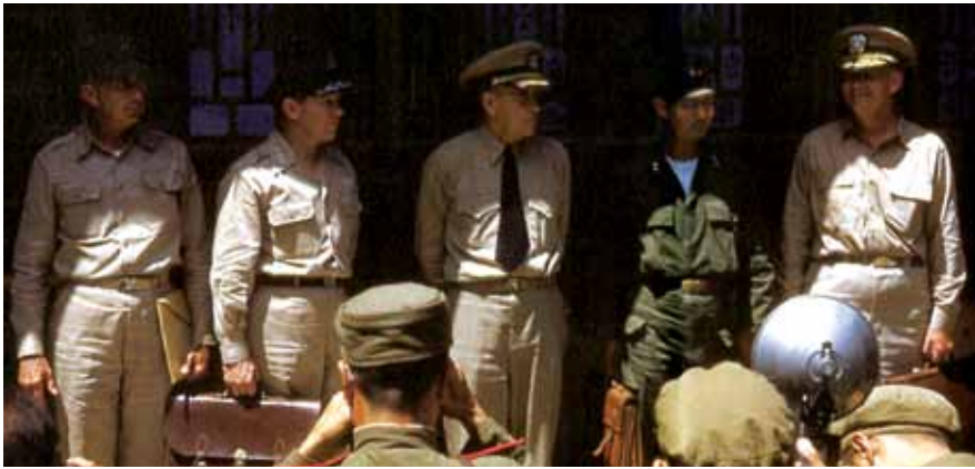
UN representatives for the initial Armistice negotiations were selected by General Matthew B. Ridgway and Vice Admiral (VAdm) C. Turner Joy, Commander, Naval Forces, Far East (NFFE). L to R: Major General (MG) Henry I. Hodes, Deputy Chief of Staff, Eighth Army (EUSA); MG Laurence C. Cragie, Vice Commander, Far East Air Force (FEAF); Admiral Joy, MG Paik Sun-yup, Republic of Korea (ROK) I Corps commander; and Rear Admiral (RAdm) Arleigh A. Burke, Deputy Chief of Staff, NFFE.