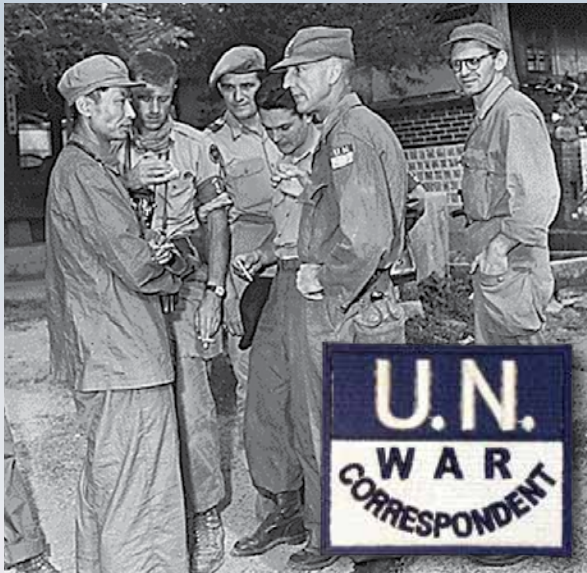
The UN Press Camp contained Allied civilian press reporters, military correspondents from Stars and Stripes , Pacific , command PIO representatives, and unit news personnel. Note the UN Correspondent shoulder patch.