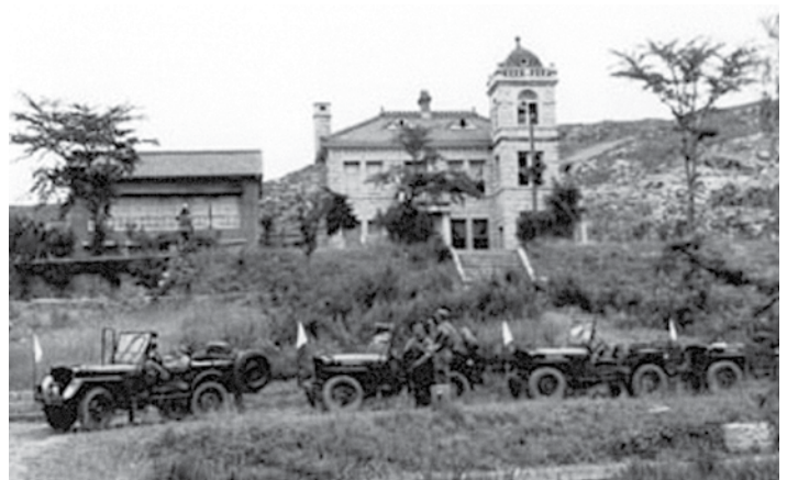
UN vehicles marked with white flags parked below the negotiations site. Communist transportation was parked above to blatantly demonstrate superiority.