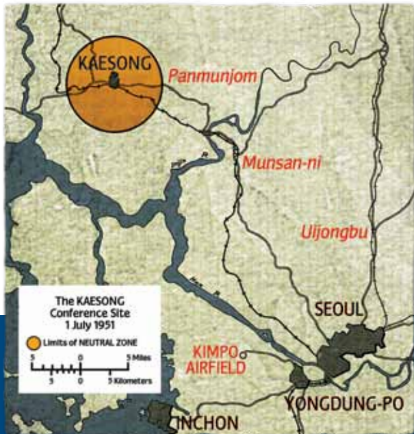
Kaesong, an ancient capital of Korea, was controlled by the North Koreans. Thus, the UN military base camp was established at Munsan-ni where the 187th Airborne Regimental Combat Team and the 2nd and 4th Ranger Companies had conducted an airborne assault as part of Operation TOMAHAWK on 23 March 1951.