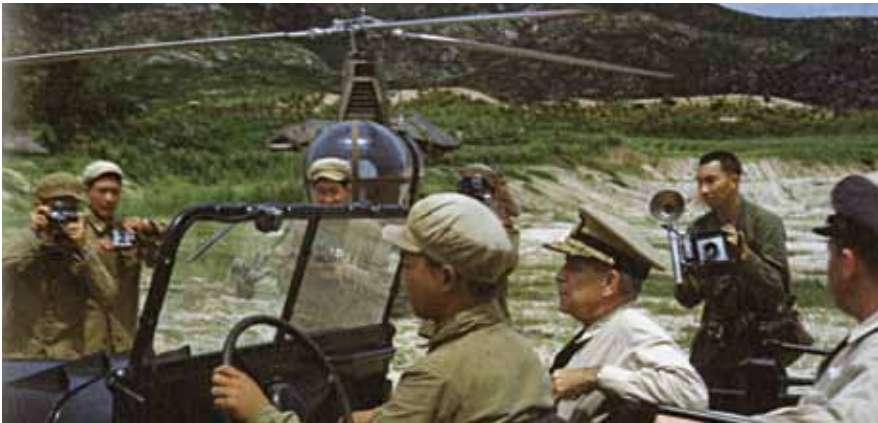
Vice Admiral, NFFE, Admiral C. Turner Joy arrives at Kaesong. Admiral Joy served as the senior UN delegate to the truce talks from July 1951 to May 1952. Note the U.S.A.F. Sikorsky H-5 helicopter in the background.