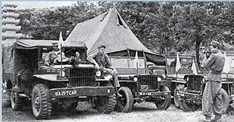
The Eighth Army [EUSA] 217th Car Company was dedicated to transport Allied military representatives and UN correspondents to and from the negotiations site. All vehicles had white flags conspicuously mounted.