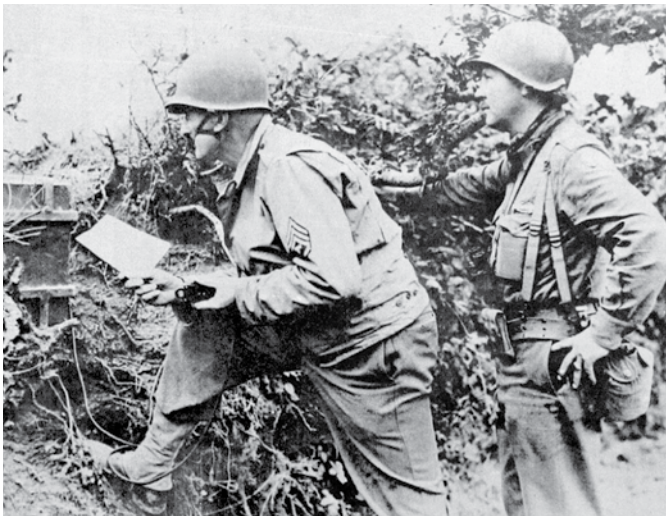
MRBC soldiers attached to First U.S. Army broadcasting surrender appeals to German soldiers. WWII MRBCs provided the organizational and operational foundation for the Korean War-era L&L Companies and MRBCs. This photo was included in the Intelligence School’s 1947 report which outlined a provisional Combat Psychological Warfare Detachment.