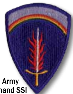
United States Army European Command SSI