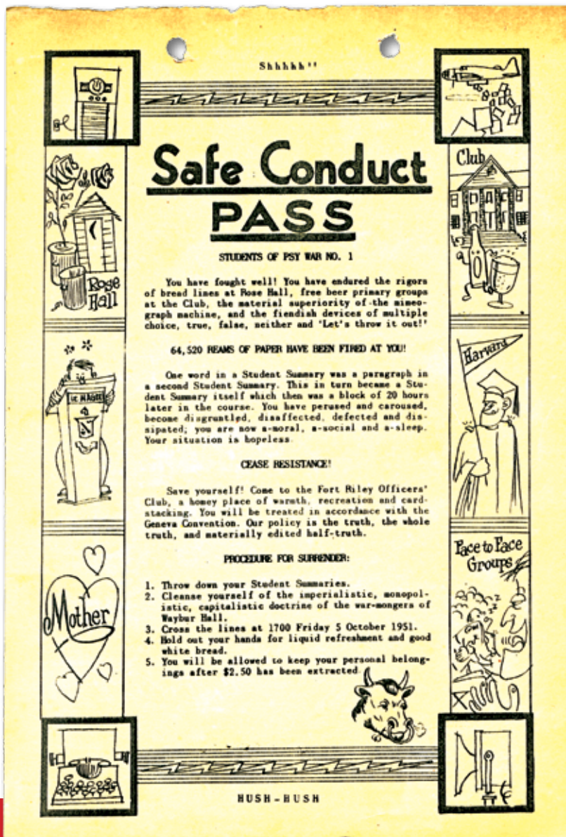
A "Safe Conduct Pass" inviting students taking the Psywar Officers Course to a social at the Fort Riley Officers' Club, 5 October 1951.

build teaching plans based "on general themes," which were then "broken down into subordinate parts." He added that materials were "pretty sparse" and "we had to rely on our imaginations for a fair amount." 23