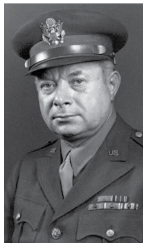
During WWII, Brigadier General David Sarnoff, Chairman of the Board of RCA and founder of NBC, worked on GEN Dwight D. Eisenhower’s staff and helped rebuild communications in Western Europe. After the war he insisted on being called “General” Sarnoff in RCA’s boardrooms. Sarnoff petitioned the Army to establish the 406th MRBC, which became the MRBC of the 301st RB&L in October 1950.