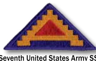
Seventh United States Army SSI

Much of the effort to expand the Army's psychological warfare capability focused on R&D. The Psychological Warfare Division at the AGS and the Psywar Board at Fort Bragg field tested new equipment such as the Harris 35" x 45" press using junior enlisted soldiers