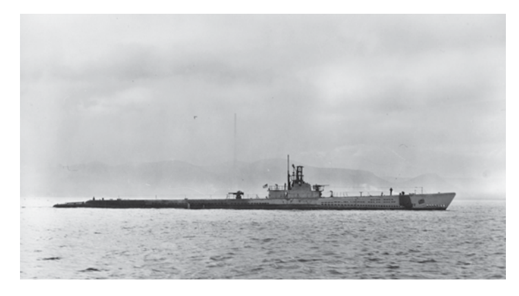
The USS Cero (SS-225) delivered fourteen soldiers and twenty tons of cargo in three separate covert landings on Luzon in the Philippines between 25 October and 2 November 1944.

For his part, MAJ Vanderpool volunteered in September 1944 for a "highly hazardous program" and was selected for the PRS.<sup>5</sup> After an intensive training course covering the establishment of intelligence networks and longrange communication systems, Vanderpool became one of sixteen "especially trained and equipped parties" dispatched to select resistance groups in the Philippines.<sup>6</sup> With the vague guidance to "do what you think will best further the Allied cause," Vanderpool boarded the attack submarine USS Cero (SS-225) bound for Luzon. After two aborted linkup attempts, the Cero reached the mouth of the Masanga River in East Luzon the night of 2 November 1944 and Vanderpool rowed ashore to a remote jungle beach. There, he linked up with his initial contact, Army