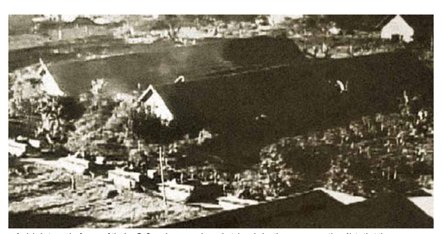
Aerial photograph of some of the Los Baños prison camp barracks taken during the rescue operation. Note that the amphibious tractors used to transport the rescued prisoners of war (POWs) are visible in the lower left corner.